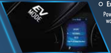
EV MODE, SPORT MODE & ECO MODE

NEW C-HR Hybrid is designed to give you an ultimate driving pleasure with uncompromised satisfaction.