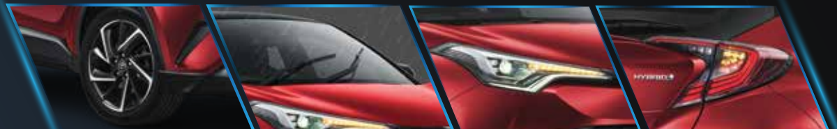
NEW 18" STRIKING ALLOY WHEEL