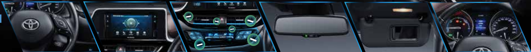
NEW STEERING SWITCH WITH AUDIO PHONE, DISPLAY AND TSS BUTTONS

THE BLACK AND BROWN INTERIOR WITH WELL CRAFTED DETAILS AND TEXTURES CREATING A CALM AND COOL ATMOSPHERE